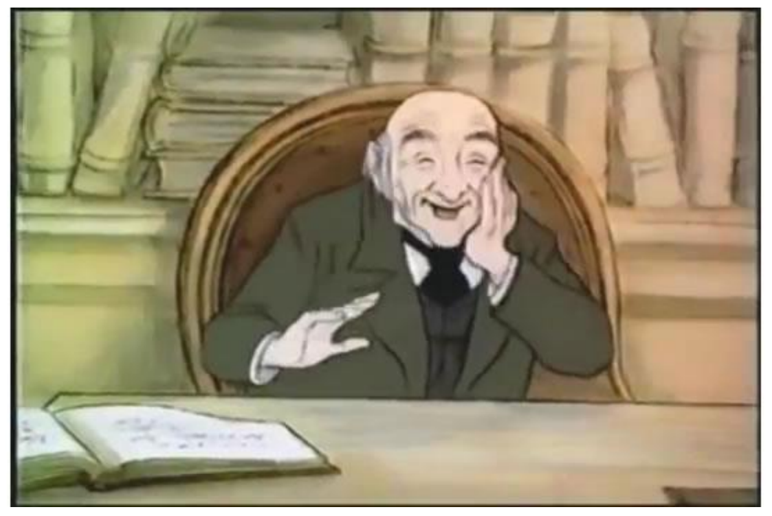
From that day on Scrooge lived a happy life and always celebrated Christmas by generously giving to those in need.